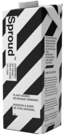
Sproud Plant-Based Beverage