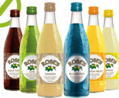
Rose's Flavoured Cordial