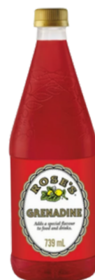
Rose's Grenadine Syrup