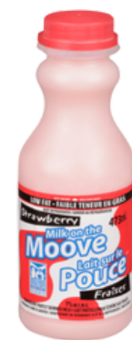
Milk on the Moove Partly-Skimmed Milk (1% M.F.)