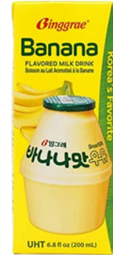
Binggrae Banana Flavoured Milk Drink