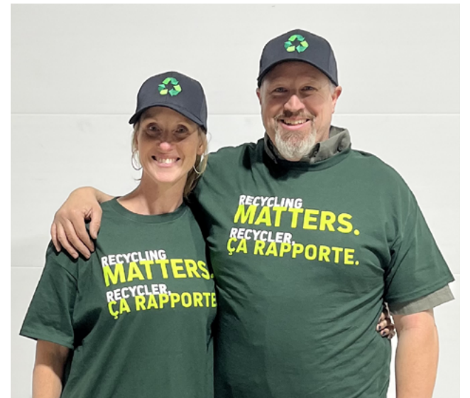
The owners of Recyclage Beaurivage Recycling in Saint-Louis-de-Kent were eager to start their new venture.