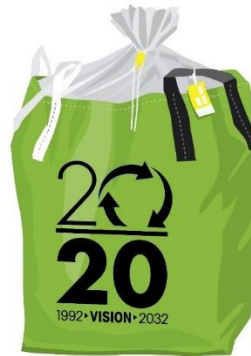
Closed bulk bag for shipping with yellow tag – duffle top closed