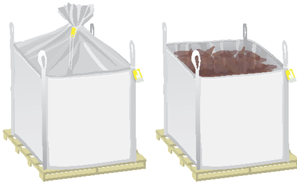
Specialty bulk bag with yellow tag

Insulated plastic (HDPE) or woven polypropylene (PP) bulk bag with single panel sidewalls and double panel bottom (sides and bottom include corrugated plastic supports).