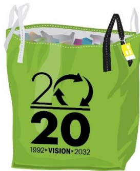
Open bulk bag with yellow tag – duffle top tucked in

Woven polypropylene (PP) with single panel sidewalls, double panel bottom and duffle top with b-lock tie string on to enclose and secure contents. Four (4) cross-corner lifting loops and one (1) discharge handle on bottom panel.