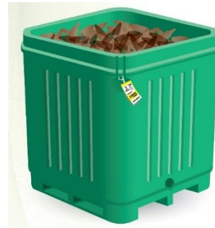
Glass tub with yellow tag